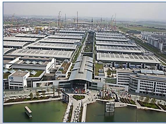
figure 3 / © Messe München GmbH

project start: 2011 / opening: 30. October 2012 construction period: 17 months total floor area:15,600 m<sup>2</sup>. project size: new construction of the largest Turkish Embassy worldwide